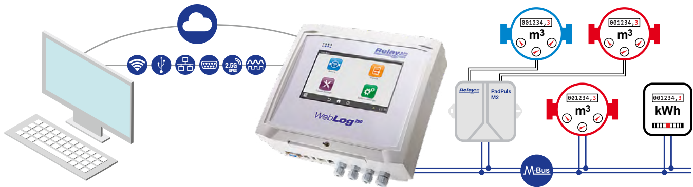
Remote access via web browser