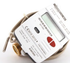
THERMAL ENERGY METERS