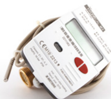
THERMAL ENERGY METERS