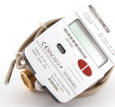
THERMAL ENERGY METERS