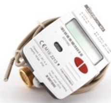
THERMAL ENERGY METERS